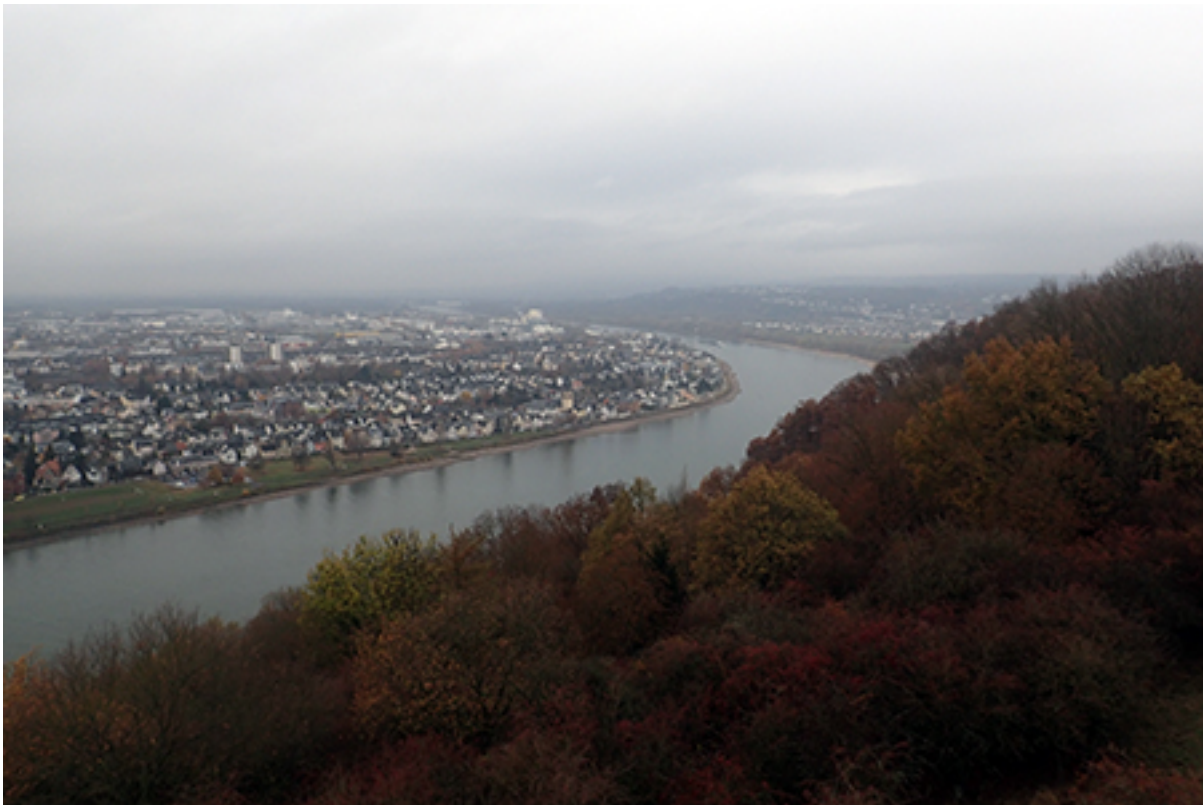
Koblenz/ River Rhine , Start of the Race

The Trailrun goes from Koblenz to Bonn on the Rheinsteig-Wanderweg. A 140km run.