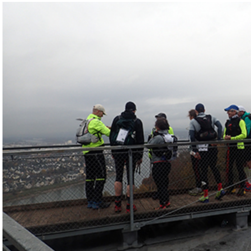
Start of the Race at the former Bundes